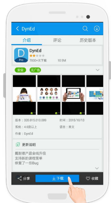
点击下载 DynEd Pro 课件 App Push here to download the DynEd Pro App.