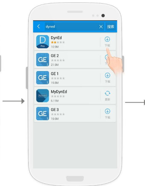
输入 dyned 进行搜索 Search for "dyned"